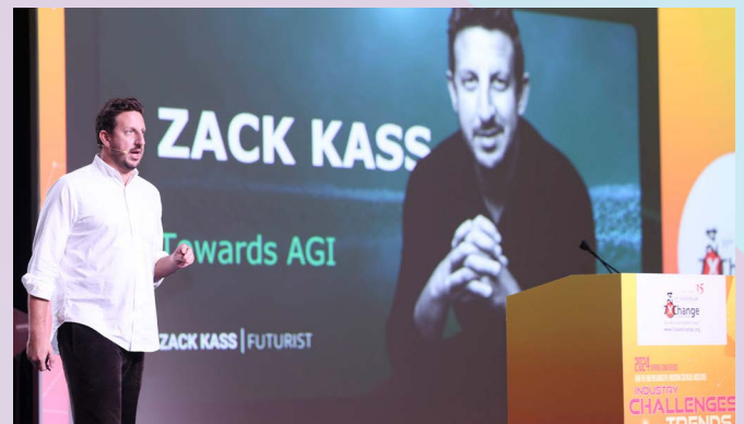
Conference Keynote kicking off the Spring Conference