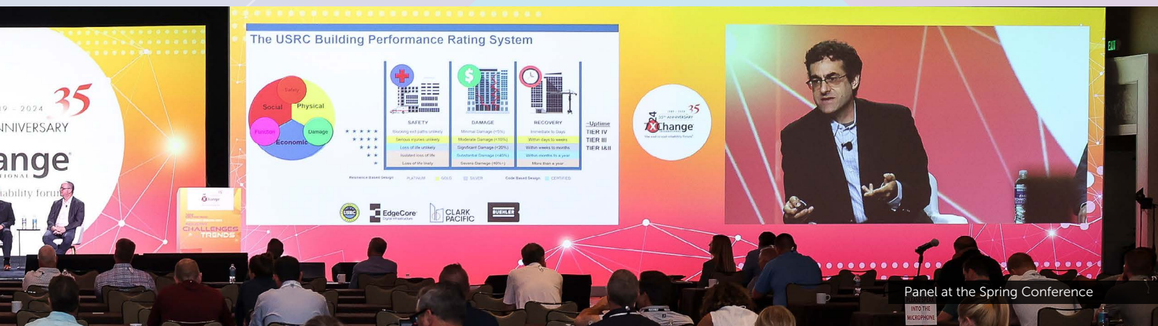
Panel at the Spring Conference