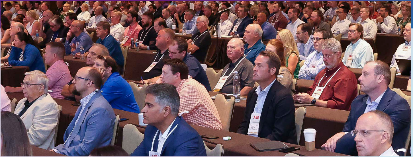
Spring Conference attendees learning