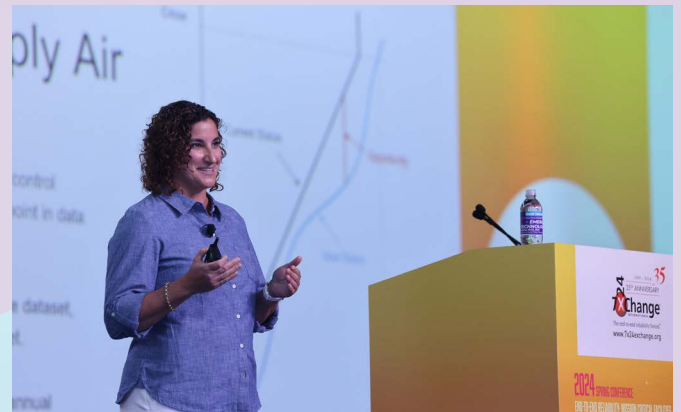
Spring Conference speaker delivering a technical presentation