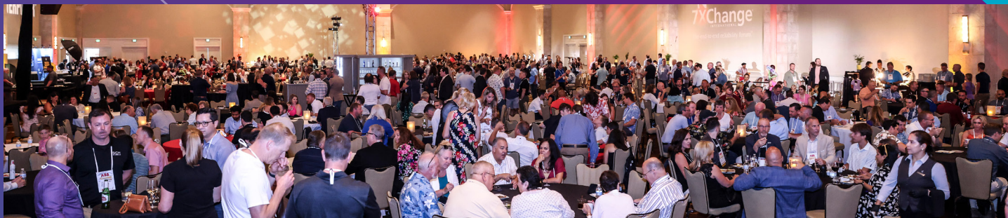
Welcome Reception at the Spring Conference

END-TO-END RELIABILITY: MISSION CRITICAL FACILITIES