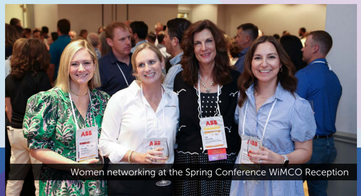
Women networking at the Spring Conference WiMCO Reception