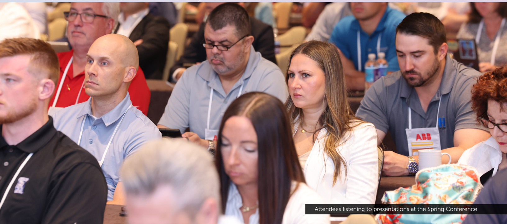
Attendees listening to presentations at the Spring Conference