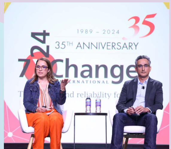
Speakers delivering a presentation at the Spring Conference