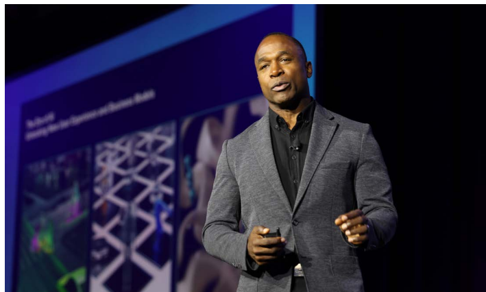
Fall Conferences speaker addresses attendees