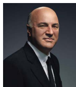
Kevin O'Leary Investor on ABC's Shark Tank & Chairman of O'Leary Financial Group

Kevin O'Leary will take you on a behind-the-scenes look at his two hit shows, Dragons' Den & Shark Tank. He'll share entertaining and insightful outtakes from his TV shows – videos you can't see anywhere else, along with a current economic overview and how it relates to the mission critical industry.