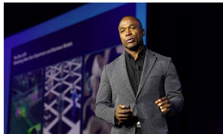
Fall Conferences speaker addresses attendees