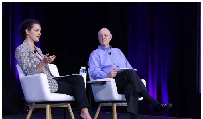
Speakers address Fall Conference attendees