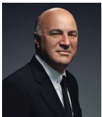
Kevin O'Leary Investor on ABC's Shark Tank & Chairman of O'Leary Financial Group

Kevin O'Leary will take you on a behind-the-scenes look at his two hit shows, Dragons' Den & Shark Tank. He'll share entertaining and insightful outtakes from his TV shows – videos you can't see anywhere else, along with a current economic overview and how it relates to the mission critical industry.