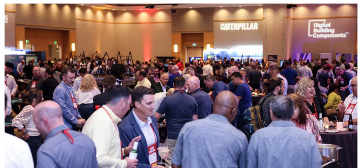
Attendees networking at the Fall Conference

Join 7x24 Exchange for a spectacular journey into the movies! Experience iconic films, interactive surprises, and fun for all ages. Don't miss out on this cinematic adventure!