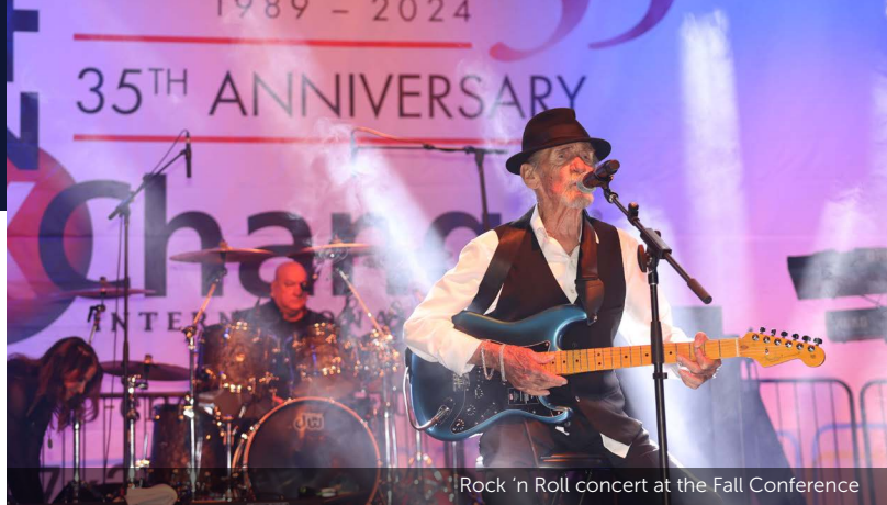
Rock 'n Roll concert at the Fall Conference