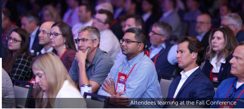
Attendees learning at the Fall Conference